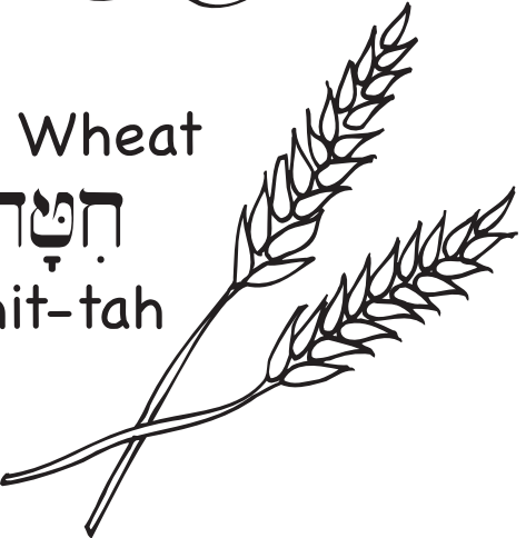
Wheat חִטָּה Chit-tah