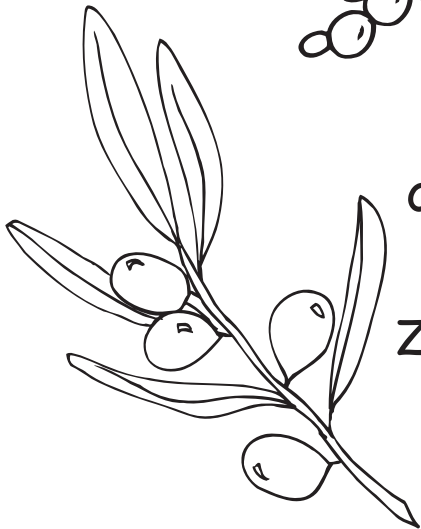
olive זַיִת Zay-it