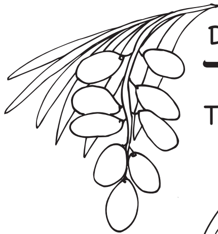
Date תָּמָר Tamar